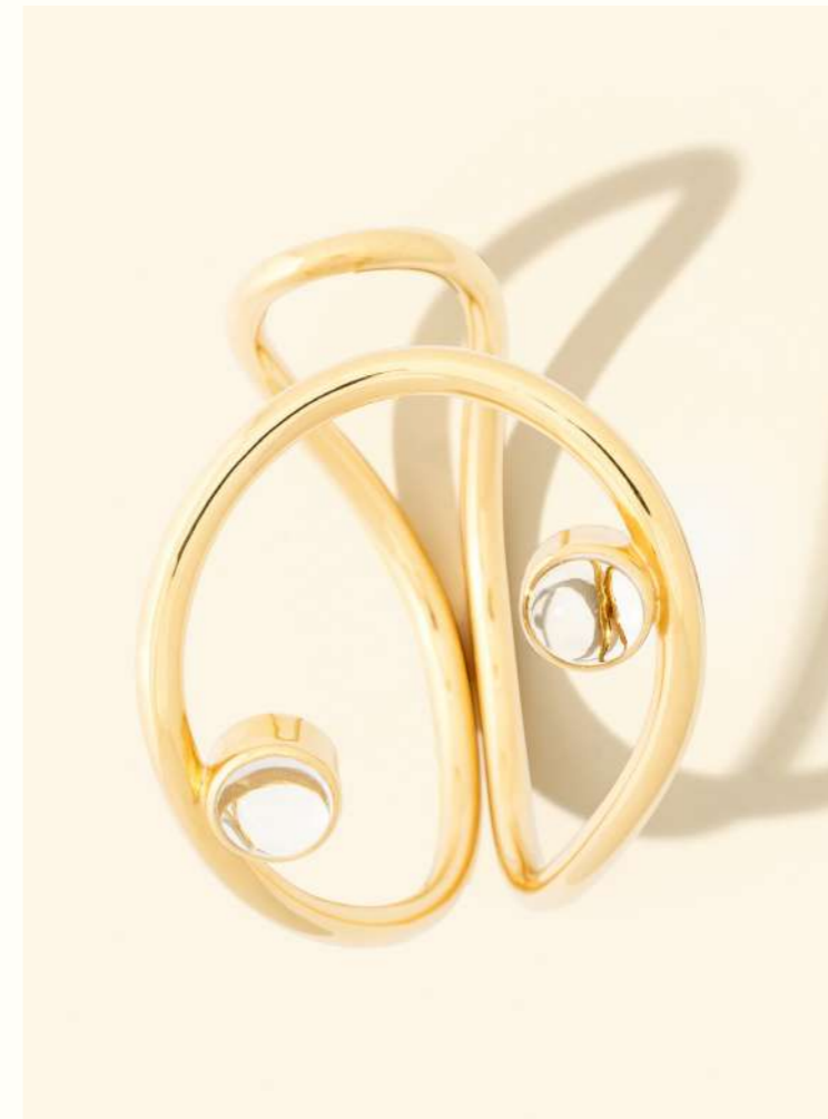
CELESTE CUFF Vermeil set with quartz. 2100 €