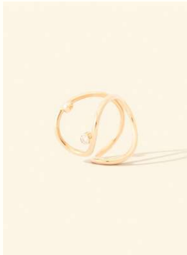
ORBITE RING 18k yellow gold set with diamonds. 3100 €