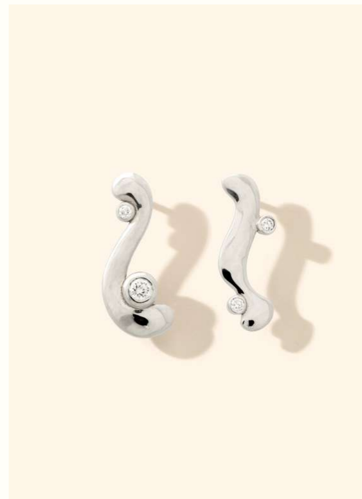
BOCA EARRINGS 18k white gold set with diamonds. 3500 €