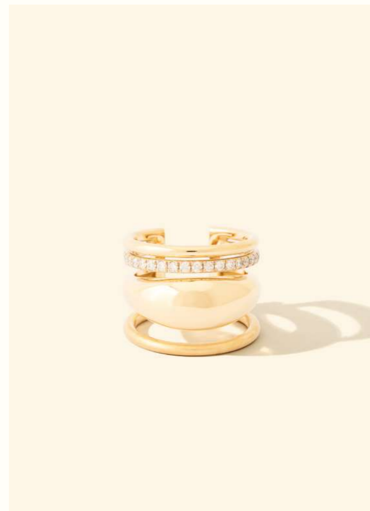
COMÈTE RING 18k white gold set with diamonds. 4350 €