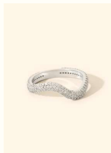
ROSARIO DIAMANTÉE RING 18k white gold set with diamonds 7500 €