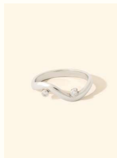
ROSARIO RING II 18k white gold set with diamonds. 2800 €