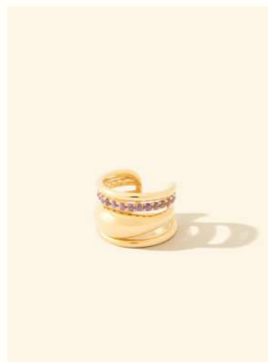
MINI COMÈTE EARCUFF 18k yellow gold set with amethysts. 1600 €