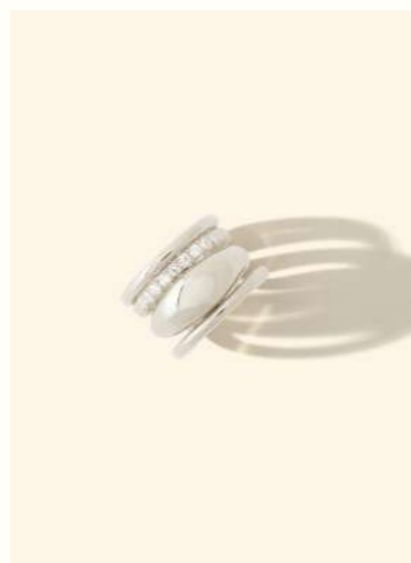
MINI COMÈTE EARCUFF 18k white gold set with diamonds. 1700 €