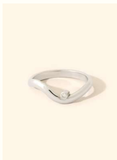
ROSARIO RING I 18k white gold set with a diamond. 2300 €