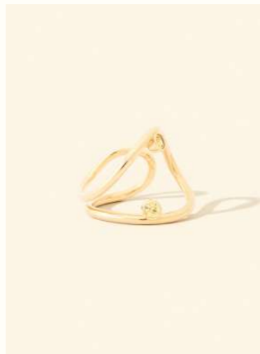
ORBITE RING 18k yellow gold set with yellow sapphires. 2300 €