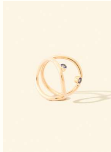
ORBITE RING 18k yellow gold set with tanzanites. 2300 €