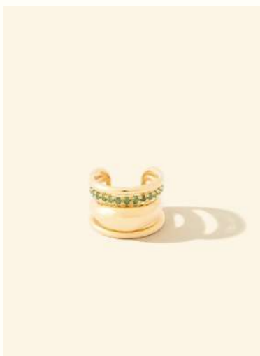
MINI COMÈTE EARCUFF 18k yellow gold set with tsavorite garnets. 1600 €