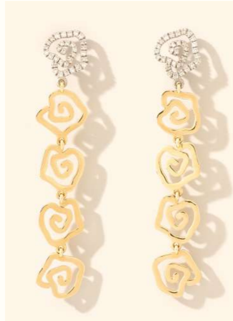
MIRADA PENDANTES EAR-

18k yellow and white gold set with diamonds.