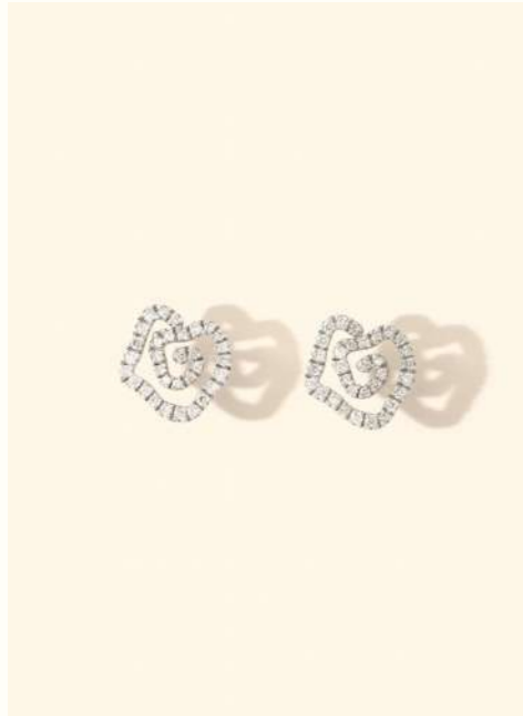
MIRADA DIAMANTÉES EARRINGS