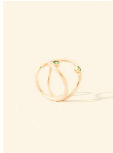
ORBITE RING 18k yellow gold set with tsavorite garnets. 2300 €