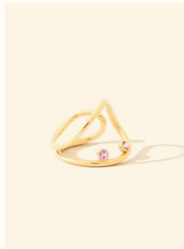
ORBITE RING 18k yellow gold set with pink sapphires. 2300 €